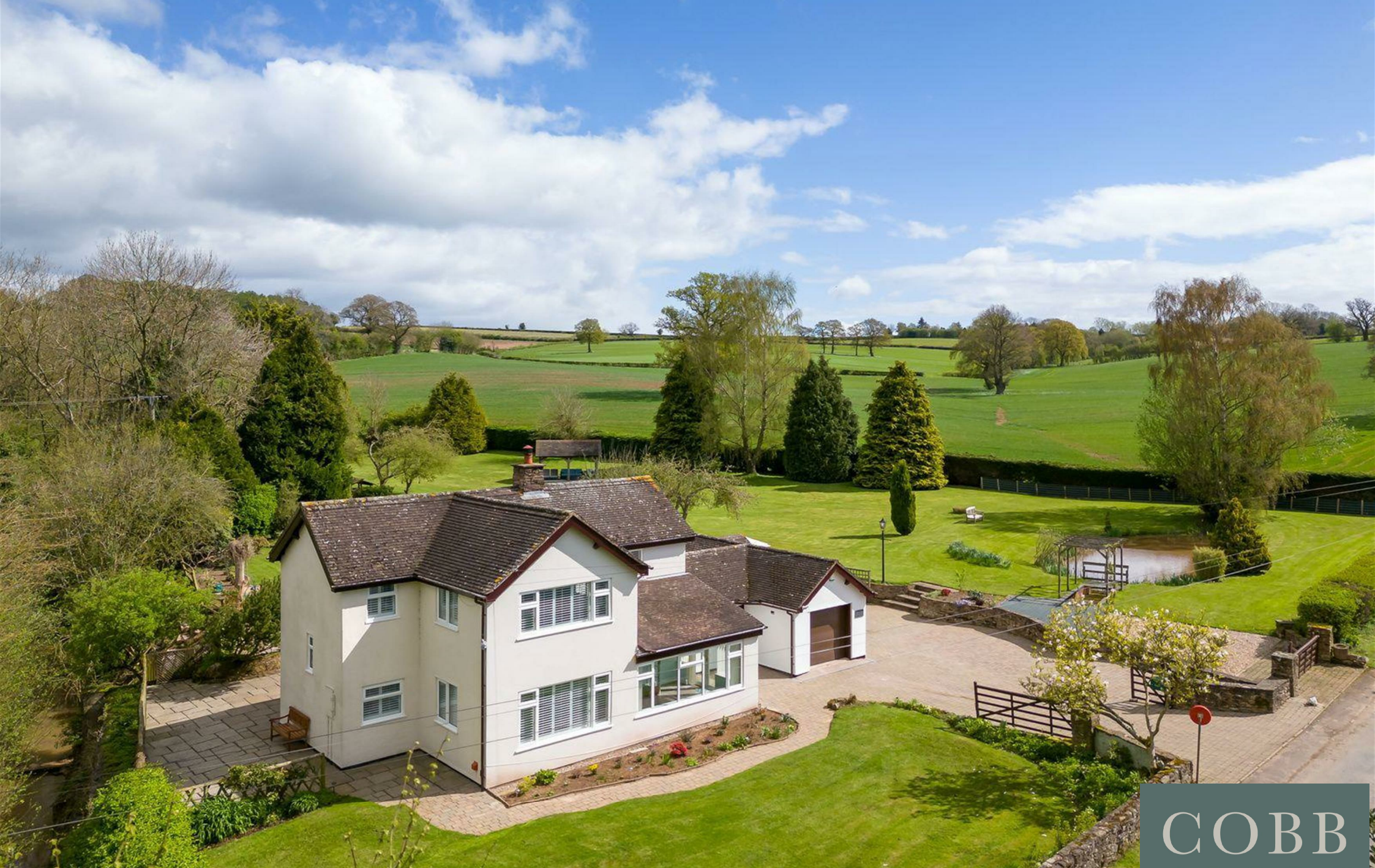
Stony Bridge Cottage, Tedstone Wafre, HR7 4PP Price £799,000